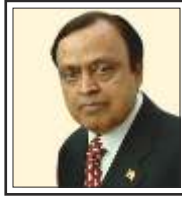
Murli Deora Union Minister, Corporate Affairs Ministry of Corporate Affairs

Ministry of Corporate Affairs Government of India