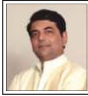
R.P.N. Singh Minister of State, Corporate Affairs Ministry of Corporate Affairs

Ministry of Corporate Affairs Government of India