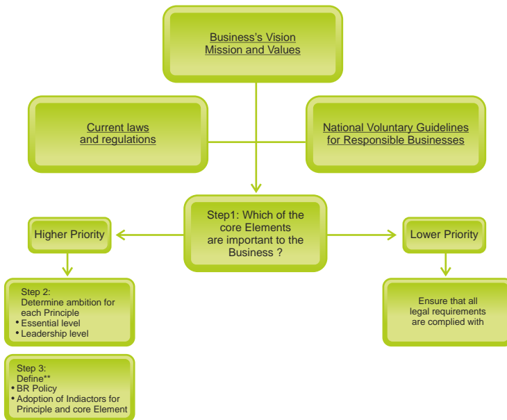
Figure 1 Adopting the Guidelines: A Suggested Approach

Priority may be determined by their alignment with internal values and business benefits. The latter may be determined using the Business Case Matrix described in the next section.