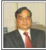
D.K. Mittal Secretary Ministry of Corporate Affairs

Ministry of Corporate Affairs Government of India